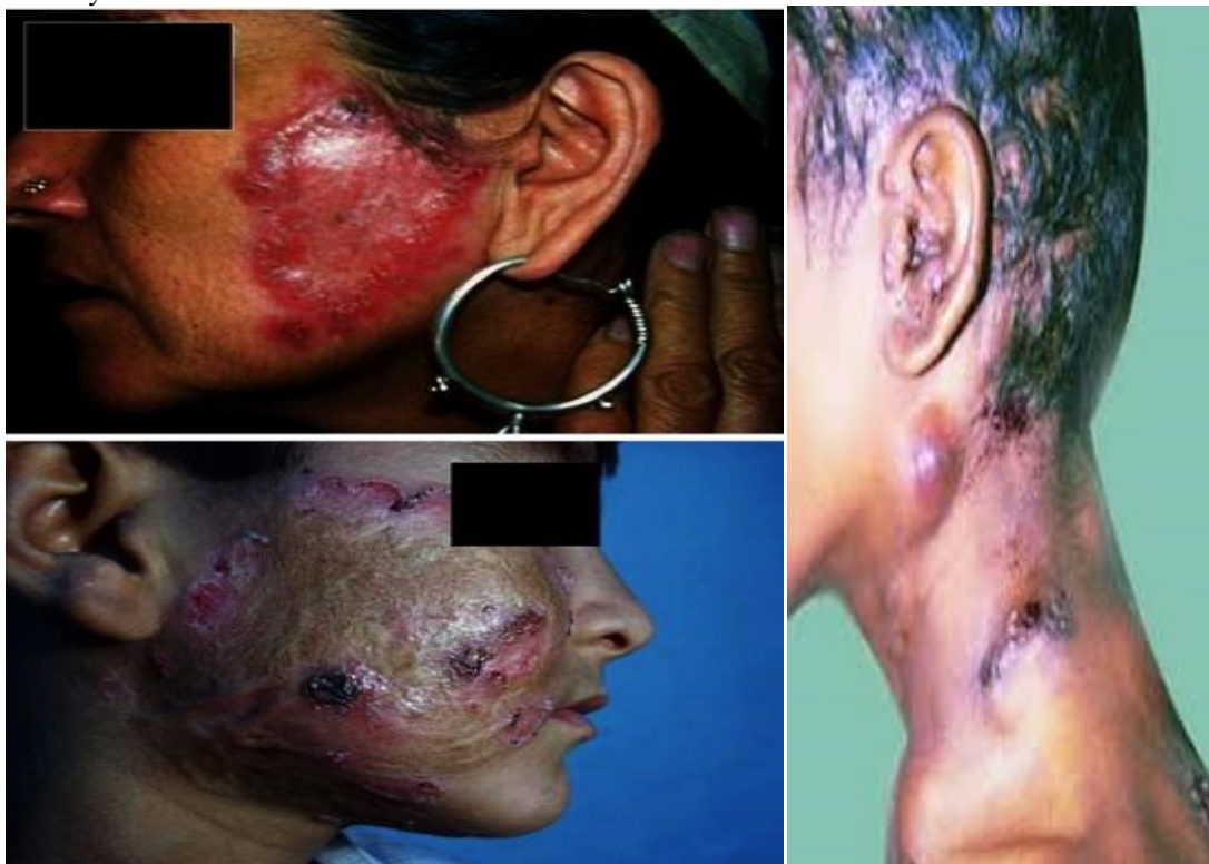
Plate I: Extra pulmonary tuberculosis presentation, (Dylan, 2018)

People are in more fears, as a result of changes in respiratory fungal community and its relevance in patients with pulmonary tuberculosis these days, due to changes in their infection pattern (Latha et al. , 2011) Although Candida albicans continues to dominate species in pulmonary candidiasis (Fidel et al. , 1999; Badiee and Alborzi 2011; Latha et al. , 2011), many other non- albicans Candida , are increasingly infecting humans, where some are linked to specific groups of factors others are associated to particular patients types (Trofa et al. , 2008). Presently, tuberculosis appears to be a public health issue, as about two million people die of the disease annually with additional nine million being newly affected (De Backer et al. , 2006). According to reports in India, for instance, the rate of all types of tuberculosis, in the average, stands at around 5.05 in one thousand, similarly, the rate of smear-positive incidence, is averagely 2.27 in a thousand, however, annual incidence rate of smear positive was found to be 84 in 100,000; But same illness also occurs in other body parts, not only lungs i.e extra pulmonary tuberculosis (Chakraborty, 2004). Plate I shows some presentations of extra pulmonary tuberculosis.