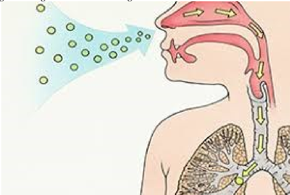
Plate III: The infectious propagules (spores) of fungi inhaled to the lungs (Speciality medical dialogue, 2016)

People get infected by Cryptococcus species as a result of inhalation of the its spores in the air, and the rate of the disease is found to by high in the past 2 decades, due to HIV and use of immuno-suppressive agents (Dromer et al. , 1996). Plate III shows fungal infectious propagules being inhaled into the lungs.